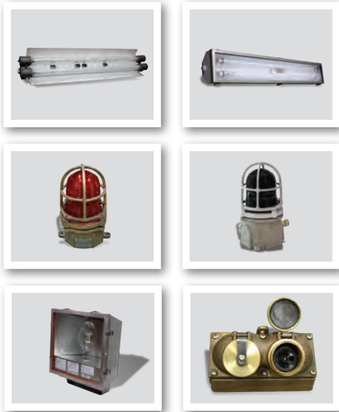
Explosion Proof lightings & wiring devices