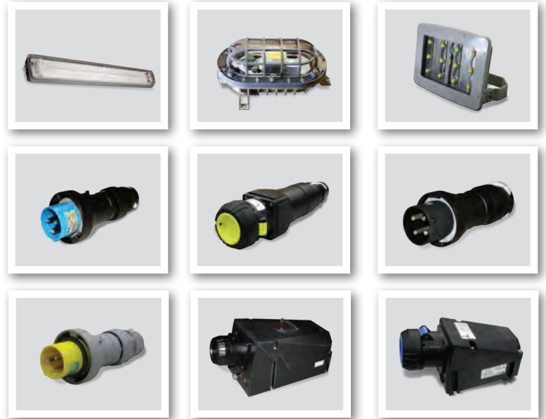
Explosion Proof lightings, plugs & Sockets