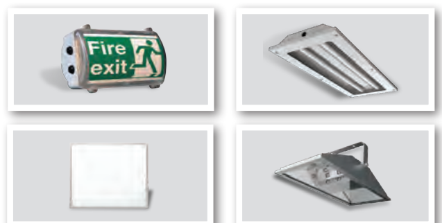
Explosion proof lightings, junction boxes