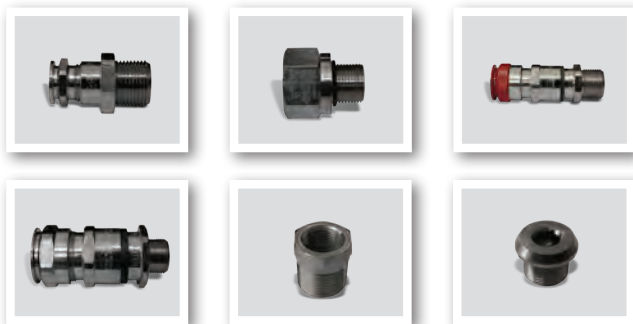
Explosion proof cable glands, adaptors, reducers & stopping plug