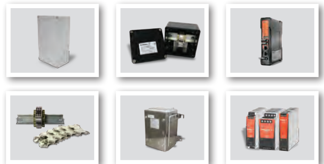
Explosion proof terminal blocks, junction boxes